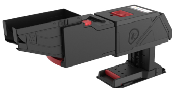
NV200S + BNF + SI (27mm & 80mm) + Free Fall