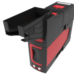
NV200S + BNF + 2.2K