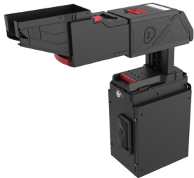
NV200S + BNF + SI (27mm & 80mm) + TEBS