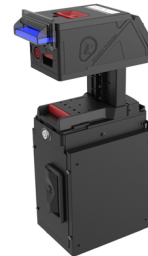
NV200S + SI (27mm & 80mm) + TEBS