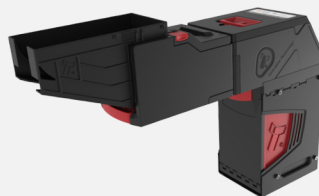
NV200S + BNF + 500