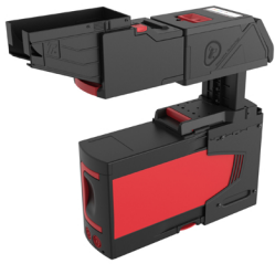
NV200S + BNF + SI (27mm & 80mm) + 2.2K