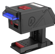
NV200S + SI (27mm & 80mm) + Free Fall