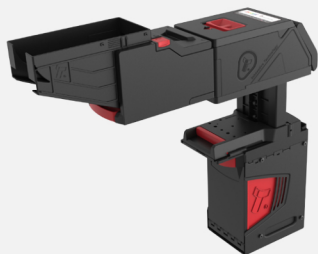
NV200S + BNF + SI (27mm & 80mm) + 500