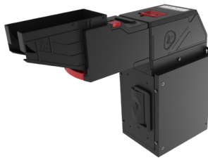
NV200S + BNF + TEBS