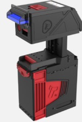
NV200S + SI (27mm & 80mm) + 1K