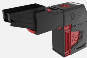
NV200S + BNF + 1K